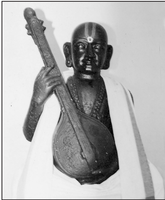
The Statue of Sri Venkataramana Bhagavathar enshrined at Thiruvaiyaru near the Samadhi of Sri Thiagaraja. Every year the Jeyanthi Festival is celebrated at this shrine by a Committee of Thanjavur Residents