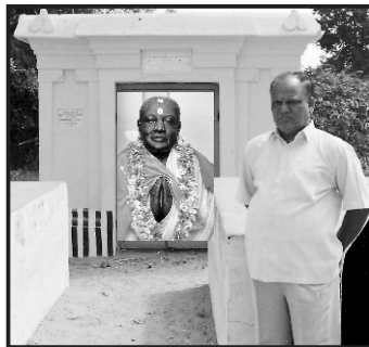
The shrine of Srimathi. Bangalore Nagarathinam Ammal at Thiruvayaroo in front of the Samathi of Sri Thiagaraja Swamy